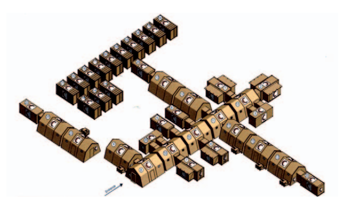
Med Mobile Field Hospital 60 beds